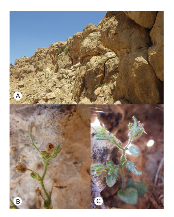
Fig. 1. Chaenorhinum gerense : A) habitat; B) a general appearance; C) fruits and flowers (GZ1093).

Examined specimens: Turkey: C8 Mardin: c. 11–13 km from Mardin to Savur, May 1957, Davis 28529 (E!), 4 km