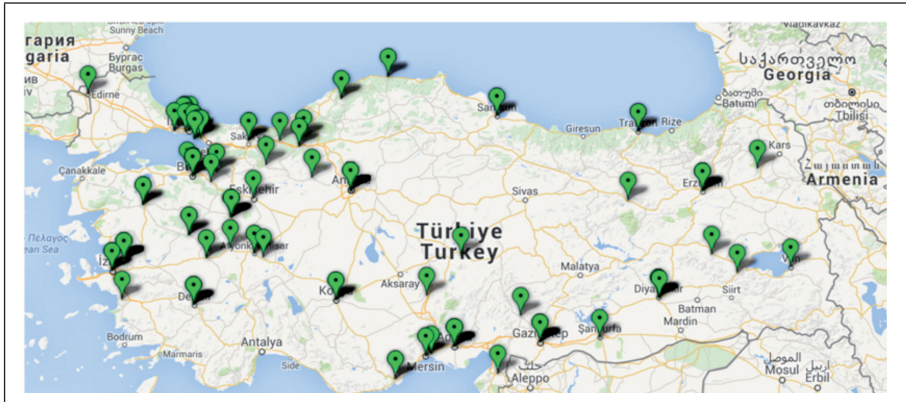
Figure 3. Map of Turkey (See interactive graph at https://goo.gl/7xeeCm ).

The letters were clearly written over a span of 13 years beginning in 1927; writing appeared to be interrupted in 1930–1931. Some important events mentioned in these letters include: